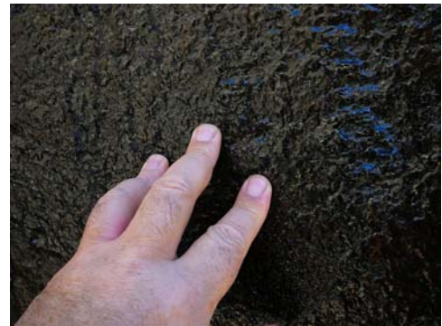
After 2 coats of Feronite Rusty Metal Primer

Once a section has been prepared, it is coated with 2 coats of Feronite Rusty Metal Primer, applied using a brush. When dry, it is then over-coated with 2 brushed coats of a high performance universal alkyd primer (Interprime 198 Grey in this case), and finally a brushed top-coat with a general purpose