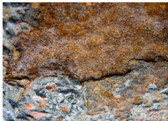
Flaky rust which is removed by chipping and needle gunning