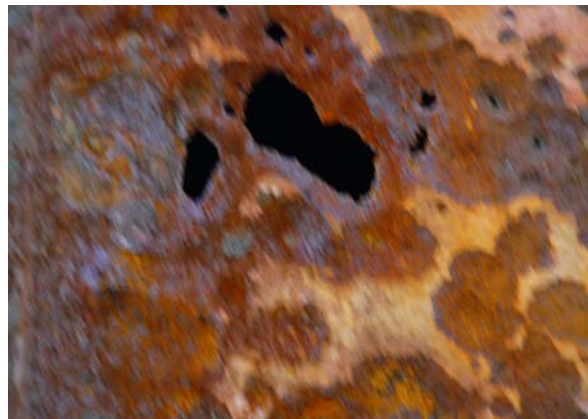
One of the many waterline rust holes.